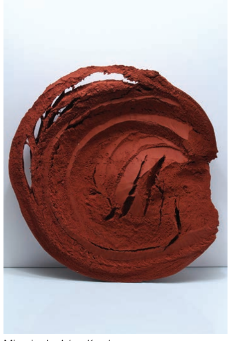
Minesite by Adam Knoche

Clay Art Center (CAC)'s regional juried exhibition, Tristate of Mind, showcases sculptural, installation and functional works by clay artists within a 75-mile radius of its home in Port Chester. As clay has become more widely-recognized in the world of contemporary fine art, the show explores the culture, trends and theories that surround contemporary art practice in our region. According to the show's juror, internationally recognized curator and gallerist Leslie Ferrin, "this exhibition will highlight emerging artists whose work in clay conveys individual expression without being derivative or technique-dominated." The work of 17 artists will be on view through March 19. Tristate of Mind kicks off "In Our Backyard," CAC's year-long focus on New York Metro-area artists